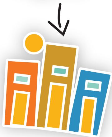
Processed at International Composting Corporation (ICC)